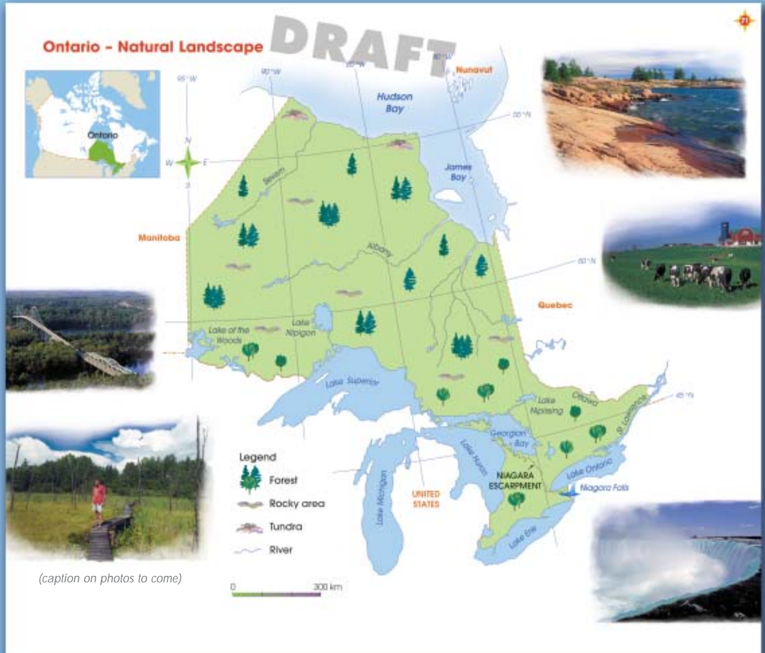
(caption on photos to come)